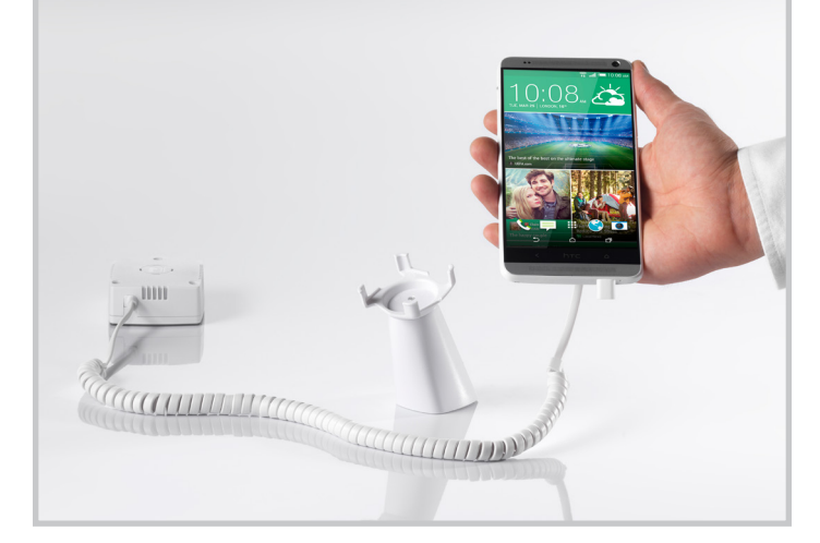
Power w/ Screamer Sensor