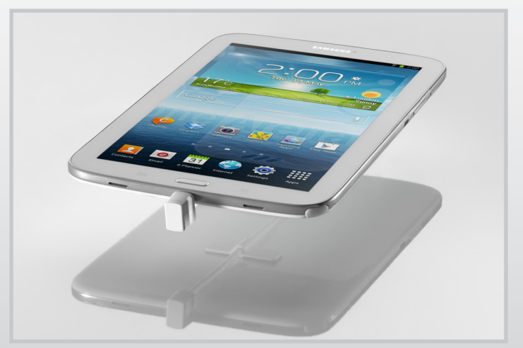
180° Micro USB Sensor